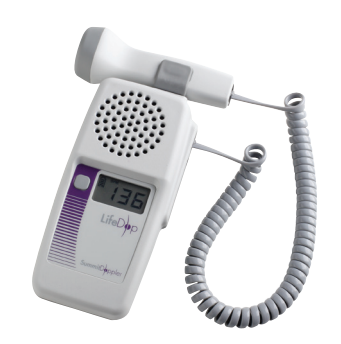
LifeDop® 250 Series