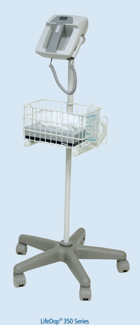
Stand is an optional accessory