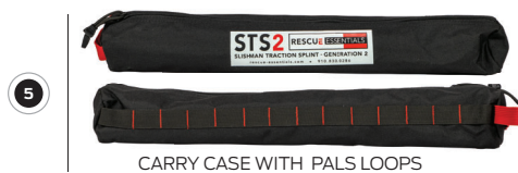
CARRY CASE WITH PALS LOOPS

Advanced design and versatile features make the STS Gen 2 a must-have device for any responders treating femur fractures. Extended length allows for no extension beyond the foot to interfere in patient transport.