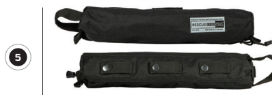
CARRY CASE WITH MOLLE SNAPS

Extremely compact and lightweight, the STS-C is designed for situations where medical equipment must be packed into difficult or remote locations. Ideally suited for search and rescue, special operations, military medics, wildland firefighters, backcountry skiers, or anyone trying to minimize pack weight and cube space.