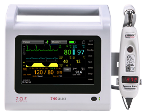
Exergen Temporal Artery Scanner

FILAC™ 3000 Predictive or Exergen TemporalScanner™