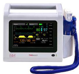
FILAC 3000 Predictive Temperature